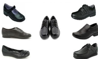
Black school shoes or plain black trainers

Our blazer and tie can be purchased from RAM Leisure