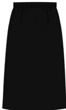
Black trousers or skirt