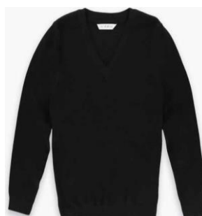
Navy V-neck jumper (optional)