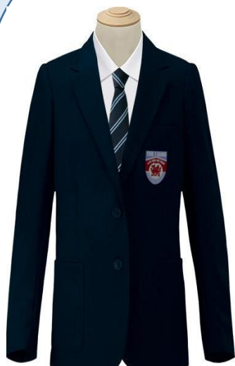
Blazer, tie and white shirt