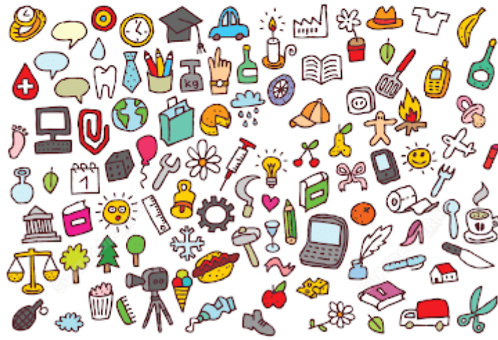
Image printed on www.supercoloring.com - for personal use only - reproduction is prohibited