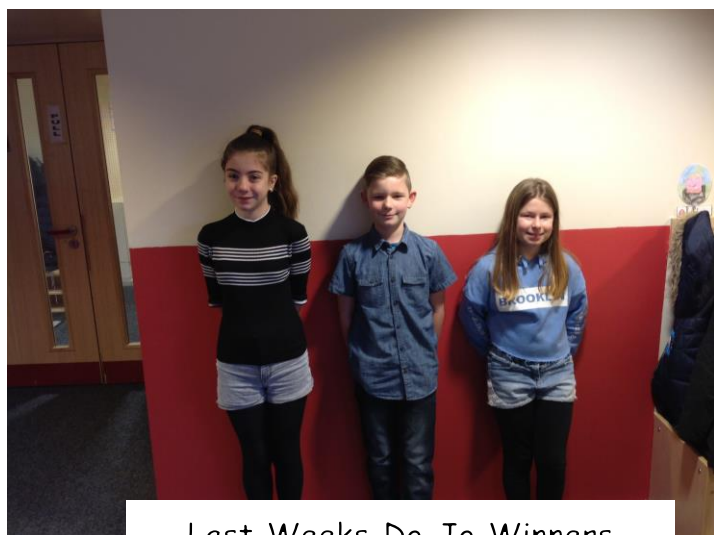
Last Weeks Do Jo Winners