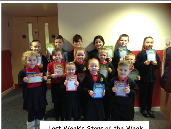
Last Week's Stars of the Week

Maths resources for Parents on line booklets at www.gov.wales/schoolsinfo4parents under Education begins at home or on www.facebook.com/beginsathome