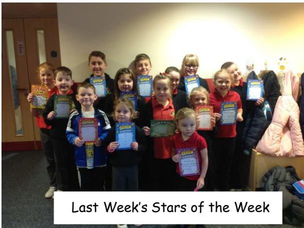
Last Week's Stars of the Week